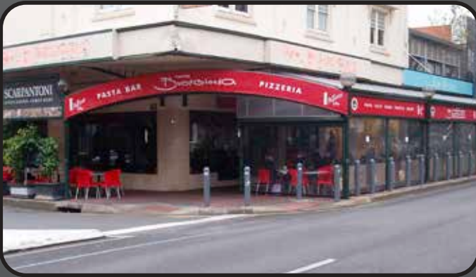
Outdoor Dining Protection